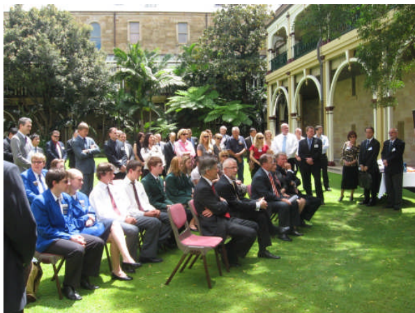
Guests at the Wandoan Education Partnership QMEA launch.