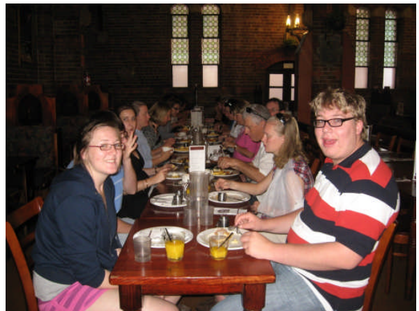
Students enjoy breakfast at Brisbane's Pancake Manner.