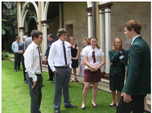
Wandoan and Taroom state school representatives mingle at the launch.